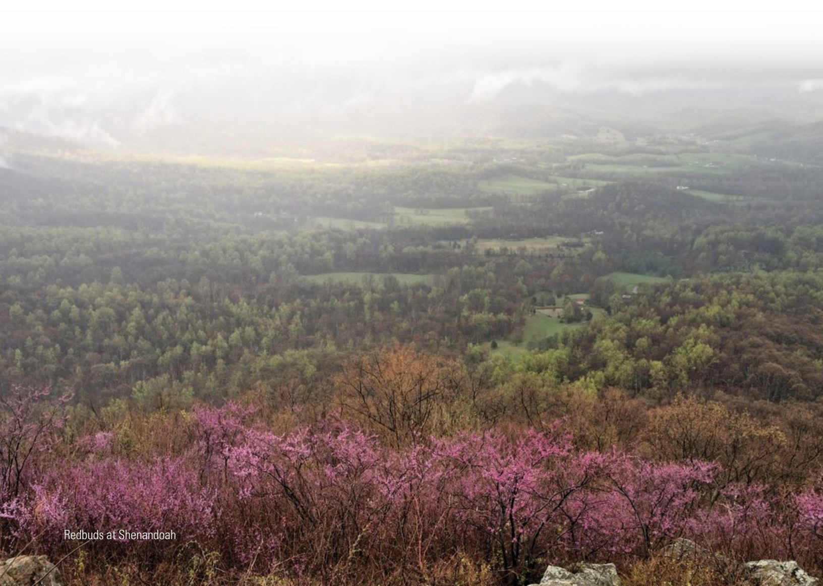
Redbuds at Shenandoah

NON-PROFIT ORG. U.S. POSTAGE PAID PERMIT #126 HARRISONBURG, VA 22801