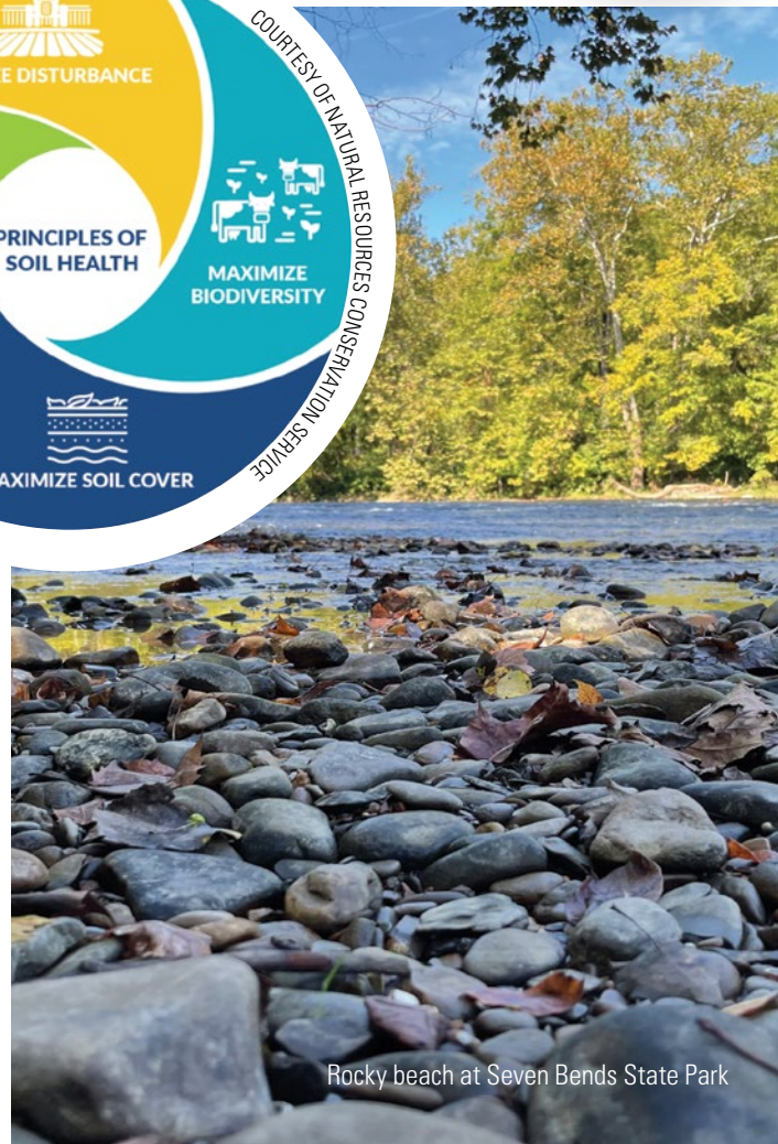
Rocky beach at Seven Bends State Park